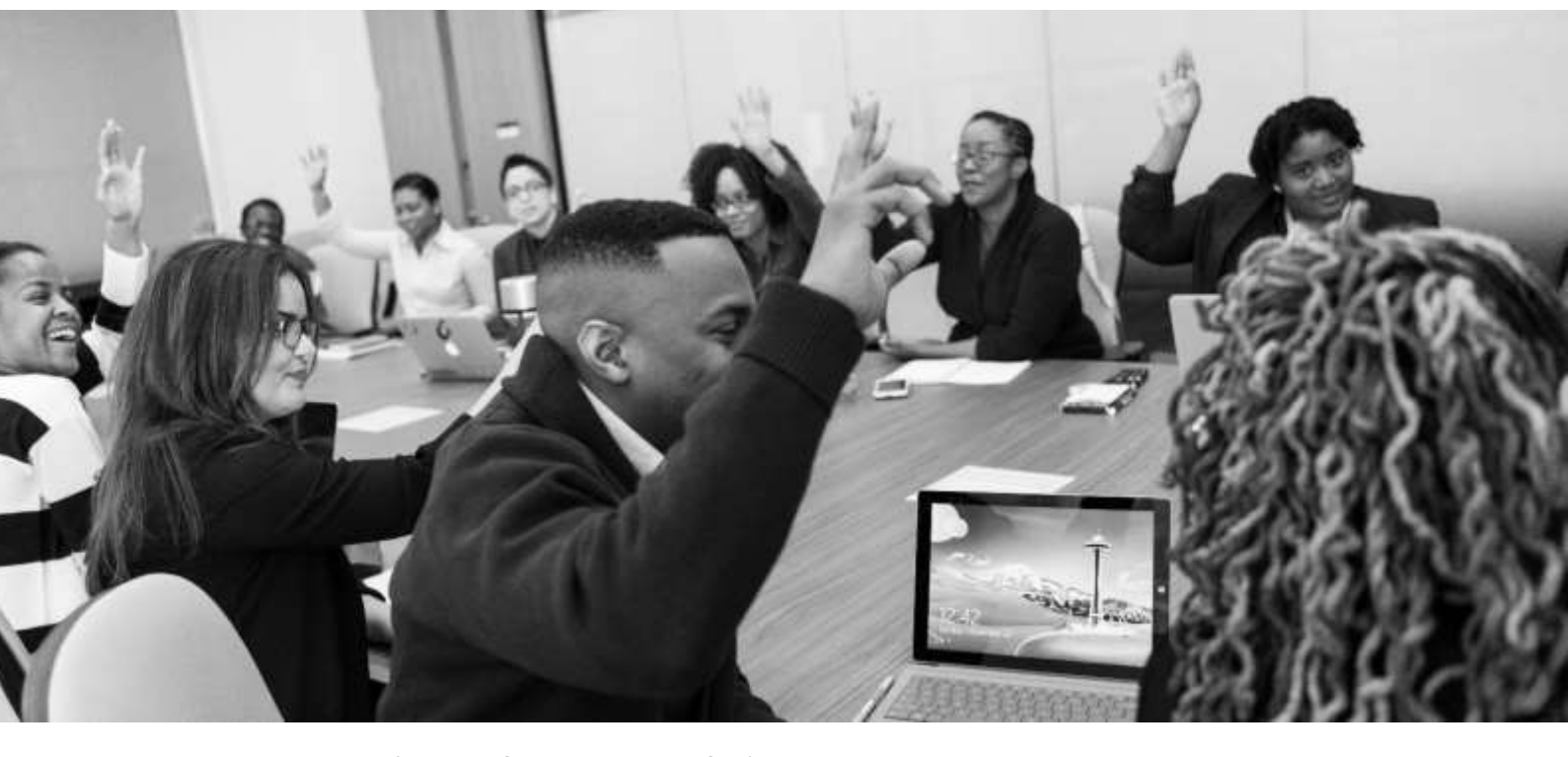
Final conference of the project MIG.EN.CUBE Project partners: